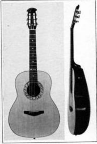
The Josh White

Here are six of the most handsome, most durably constructed and most tonally responsive guitars ever developed. They are the new Ovation roundbacks: the Balladeer, the Classic, the Josh White, the Deluxe Balladeer, the Contemporary Folk Classic and the Twelve-String.